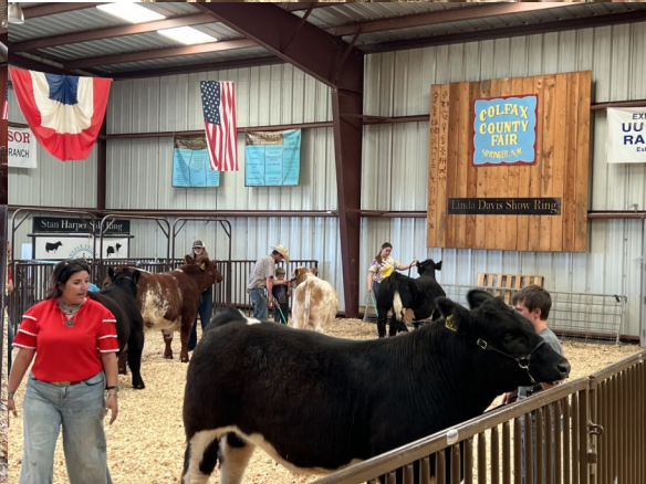
Livestock Show Clinic/ Showmanship Jackpot